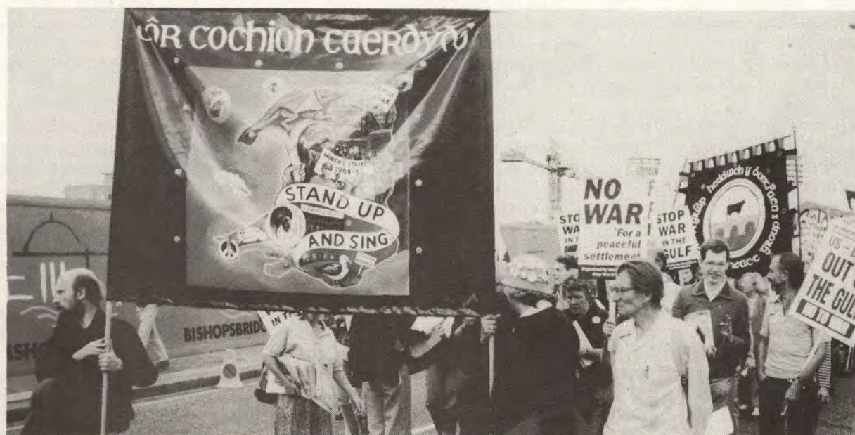
Côr Cochion join the London demonstration on September 15th.

Inside: More on CND and the Gulf Crisis, Christmas Catalogues (CND Cymru).