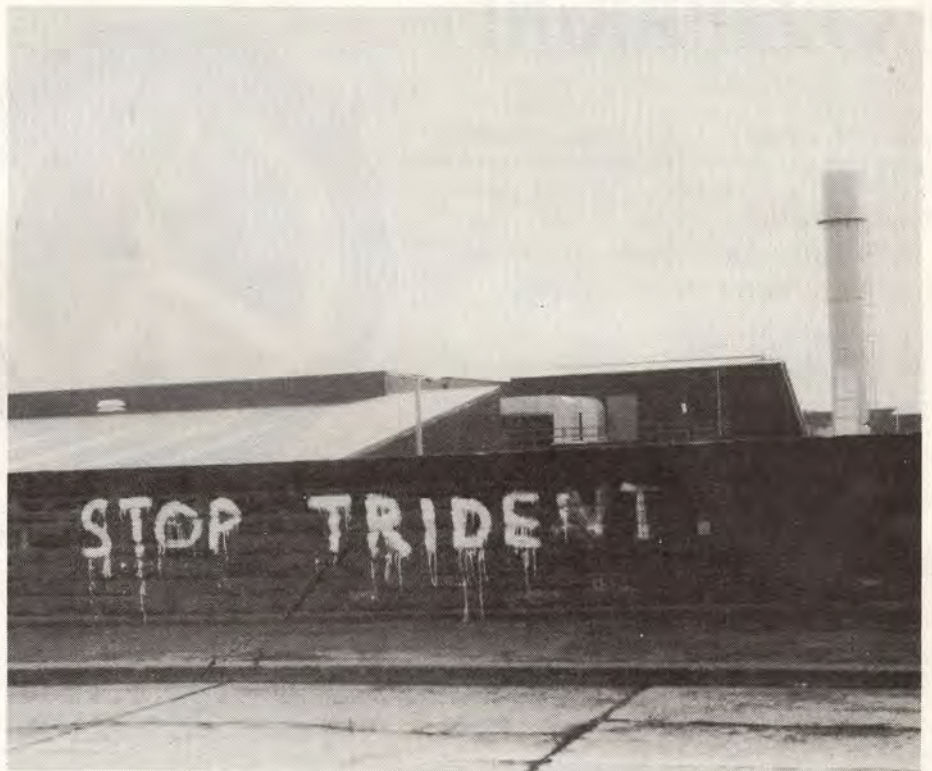
The writing is still on the wall of the Atomic Weapons Establishment.

It seems as if the opponents of low level flight training in Germany have been listened to and 1,000 ft has now become the minimum permitted height. In Wales, Scotland and Cumbria the widespread opposition has met with no similar positive response — only the endless repetitions of the need for this type of training. I have heard it suggested that instead of flying low over Wales the exercises could take place in Canada. Why not? Well this short article, received from Canada at the beginning of September, tells us why and once again emphasises the need to exchange information and work together for peace and demilitarisation.